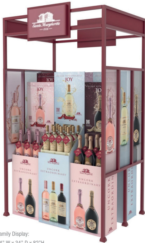
Family Display: 44" W x 34" D x 82"H

Also introduced this season: an exciting new display concept to help us gain visibility in unique points of sale. The Santa Margherita Family Display features all five varietals and a battery-powered light box header with the Santa Margherita USA logo. The visual side panels will provide the flexibility to turn the display into a multi-brand unit in the future.