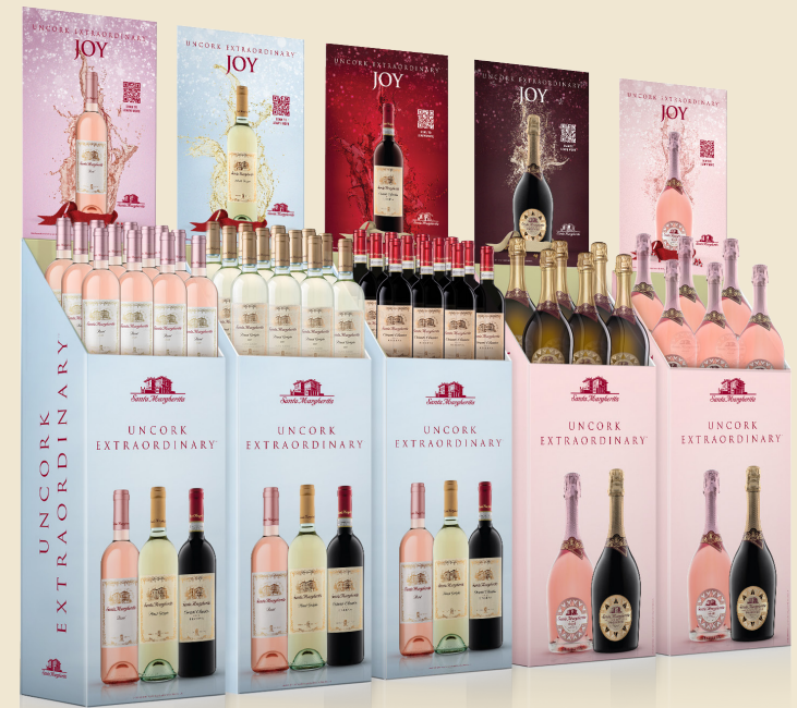
Double Sided Case Cards - 13.53" W x 25.44" H Design to be used throughout T3. Each QR code leads the consumer to varietal landing page.