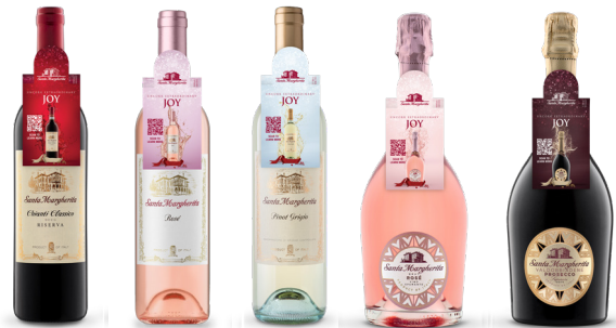
Neckers- 2.25" W x 4.5" H Design to be used throughout T3. Each QR code leads the consumer to varietal landing page