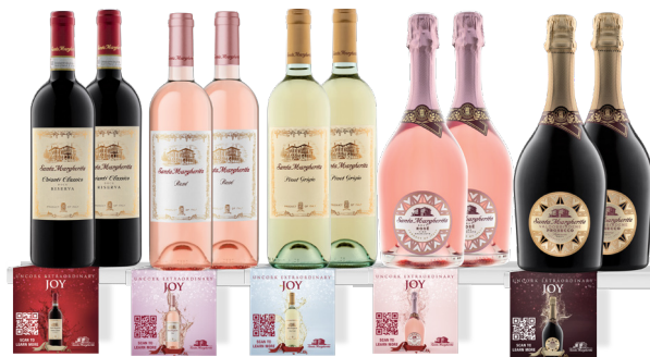
Shelf Talkers - 3" W x 3.75" h Design to be used throughout T3. Each QR code leads the consumer to varietal landing page.