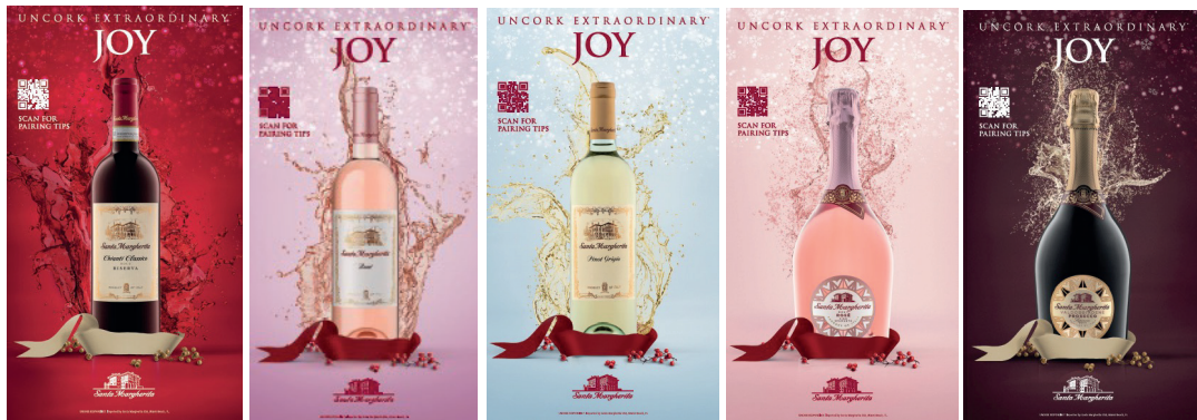
Case Glorifiers - 12" W x 23.5" H

Santa Margherita has been a leader in the premium wine industry for over 30 years, and we are proud to consistently earn our place as the #1 imported, luxury Italian wine brand over $20 in the United States*.